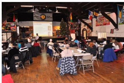
Next Step students attend a financial workshop hosted by the North Jersey Federal Credit Union