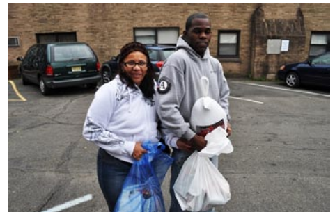
AmeriCorps members work hard during the Thanksgiving turkey distribution