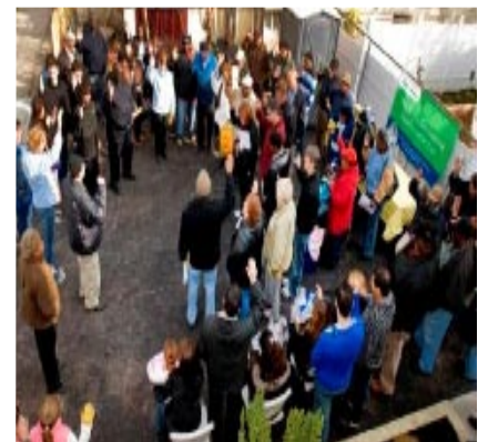
Crowd gathered to bless the new home