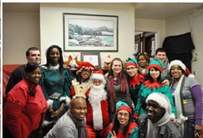
Some AmeriCorps members who participated in Adopt-A-Family this year.