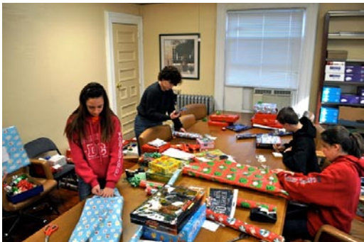
Volunteers wrapping up gifts donated by donors