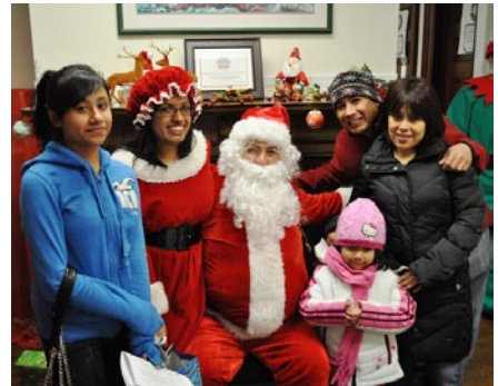
Families pose with Santa and his helpers after receiving their gifts