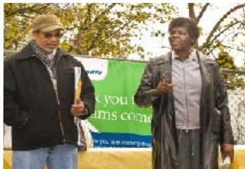
Reverends speaking at the dedication